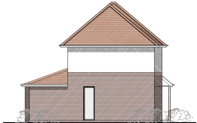
PROPOSED EAST ELEVATION SCALE 1:100 @ A3 SCALE 1:50 @ A1