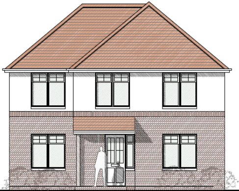
PROPOSED NORTH ELEVATION SCALE 1:100 @ A3 SCALE 1:50 @ A1