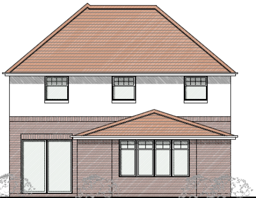
PROPOSED SOUTH ELEVATION SCALE 1:100 @ A3 SCALE 1:50 @ A1